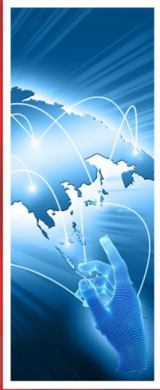
Reaching the nations personally and with technology.

BFA’s ultimate goal is to follow God’s lead to introduce the gospel to unbelievers and to build up believers to grow effectively in Christ.