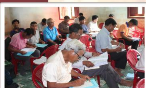
Gospel Listening Group facilitator training to motivated village believers.

"Go and make disciples..." [Matt. 28:19].