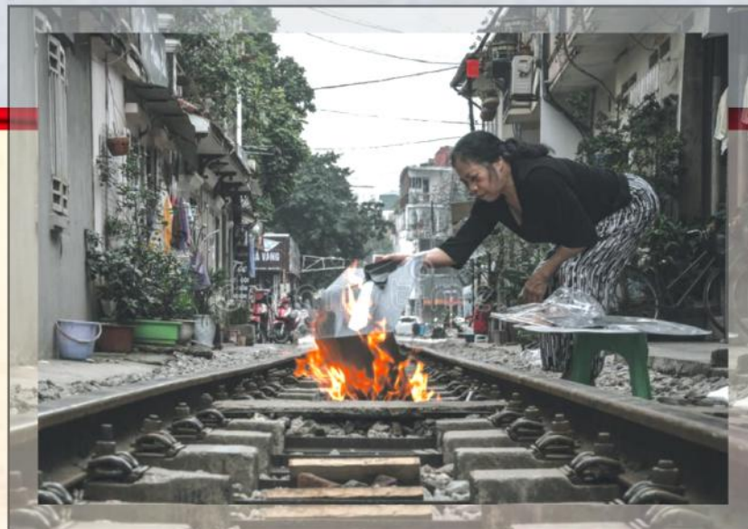
They have thrown their gods into the fire, for they were not gods but made by human hands—wood and stone. So they have destroyed them. Is 37:9

Animism is the primary religion among the hill tribes of Vietnam and beyond, that supports the belief of spirit beings dwelling within every living and non-living thing. Villagers submit themselves to appease these false gods by worshipping hand made idols in return for temporary protection and provision.