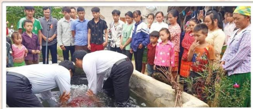
Nearly all individuals within this small village were baptized together in one day.

“Go therefore and make disciples of all the nations, baptizing them in the name of the Father and the Son and the Holy Spirit...” Matt 28:19