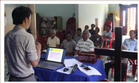
Evangelism and discipleship training to village church leaders.

Early this year, BFA was offered the use of a well-established teaching curriculum that was originally developed by International House University (IHU), a credited Hong Kong teaching affiliate of Christ for All Nations. IHU has successfully extended Christian education to 7 Asian countries, plus Canada and USA, and is now based in Los Angeles as an independent partner. Although IHU continues to contribute curriculum assistance, BFA intends to keep the Leadership Training School Program completely independent.